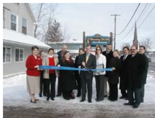
Wyoming OB-GYN 121 S. Main St., Warsaw 786-8350 www.wyomingobgyn.com