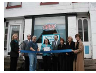
Attica Laundry Service 23 Market St. 591-1242