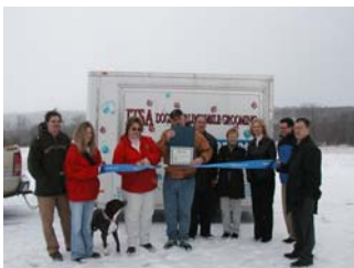
ITSA Dog's World Mobile Grooming 6175 Cowie Rd., Wyoming 495-6083

Ribbon Cuttings are a great FREE advertising opportunity if you are opening a new business. The Chamber will come out with the ribbon, scissors, and dignitaries to officially celebrate the opening or expansion of your business. We contact the local papers and issue a press release and photo of your ribbon cutting. It doesn't get much easier. Just call the Chamber at 585-237-0230 to schedule a Ribbon Cutting today.