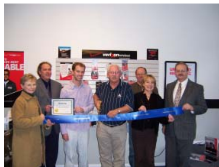
Letchworth Wireless 21 South Main St., Perry 237-0216

Ribbon Cuttings are a great FREE advertising opportunity if you are opening a new business. The Chamber will come out with the ribbon, scissors, and dignitaries to officially celebrate the opening or expansion of your business. We contact the local papers and issue a press release and photo of your ribbon cutting. It doesn't get much easier. Just call the Chamber at 585-237-0230 to schedule a Ribbon Cutting today.