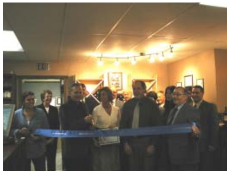
Wolfe's Wine & Brew House 249 Main St., Arcade 492-2738