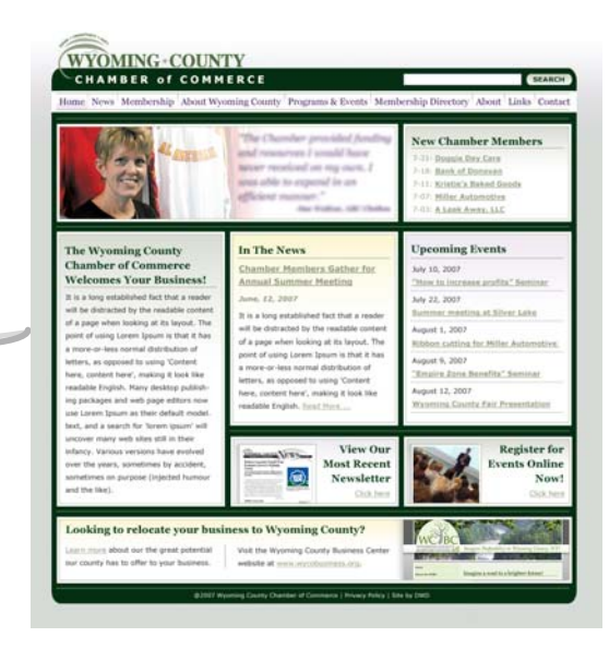
The Chamber's new website is being designed and developed by Deelicious Web Design

The Chamber is in the process of overhauling its website to provide greater use and benefit for its members. We anticipate launching the new site before the end of the month. New features will include a fresh homepage with news you can use, enhanced business listings with interactive maps and directions to your business, online program and event registration, and the ability to update any of your member contact information directly from the website, just to name a few. In addition, the new website will have expanded relocation, quality of life and workforce information for newcomers to Wyoming County and those looking to move into the county. And finally, following the launch of the new website members will receive a monthly E-