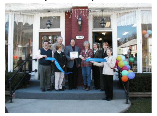
WG Handyside Gallery of Fine Arts 7 South Academy St. Rt. 19, Wyoming 495-6110