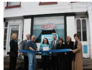
Attica Laundry Service 23 Market St. 591-1242