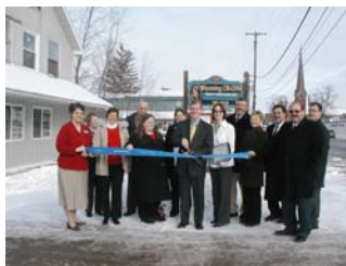
Wyoming OB-GYN 121 S. Main St., Warsaw 786-8350 www.wyomingobgyn.com