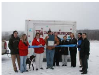
ITSA Dog's World Mobile Grooming 6175 Cowie Rd., Wyoming 495-6083

Ribbon Cuttings are a great FREE advertising opportunity if you are opening a new business. The Chamber will come out with the ribbon, scissors, and dignitaries to officially celebrate the opening or expansion of your business. We contact the local papers and issue a press release and photo of your ribbon cutting. It doesn't get much easier. Just call the Chamber at 585-237-0230 to schedule a Ribbon Cutting today.