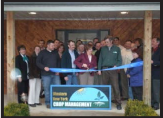
Western NY Crop Management - Rt. 19 - Warsaw