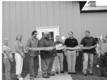
Drasgow Inc. 4150 Poplar Tree Rd., Wethersfield 786-3603