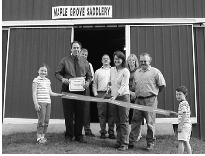
Maple Grove Saddlery and Leather Repair 2511 Blackhouse Rd., Warsaw 786-5432