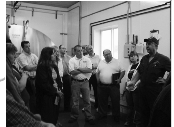
The fall 2008 ag tour will feature visits to farms and agri-businesses throughout Wyoming County

To enroll in a plan through the Chamber, a business must first join the Chamber and they can then enroll in a plan within 30 days of joining. See the cream colored insert for a complete list of plans offered through the Chamber. For more information on the plans offered through the Chamber or for information on joining, please contact the office at 585-237-0230 or visit the Chamber website at www.wyochamber.org .