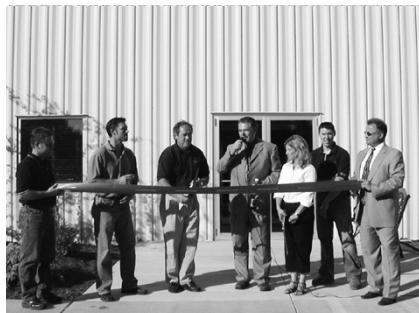
Empire Distributing 7406 Rt. 98, Arcade 492-2780