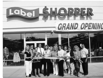
Label Shopper Tops Plaza, Warsaw 786-2790