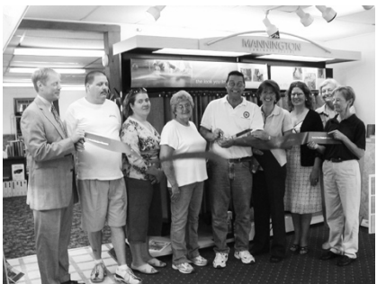
Ken's Carpet and Flooring 85 S. Main St., Warsaw 786-2340