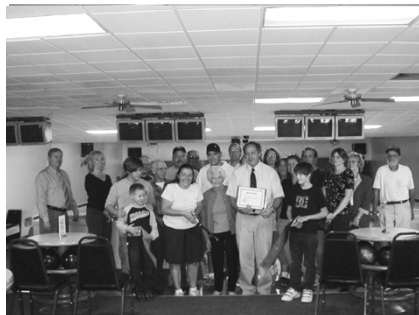
Bennington Lanes 1374 Clinton St., Bennington 591-2314