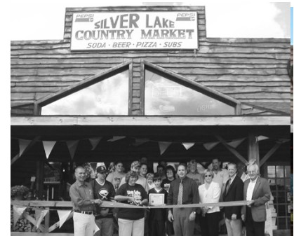
Silver Lake Country Market 205 S. Main St., Perry 237-6600