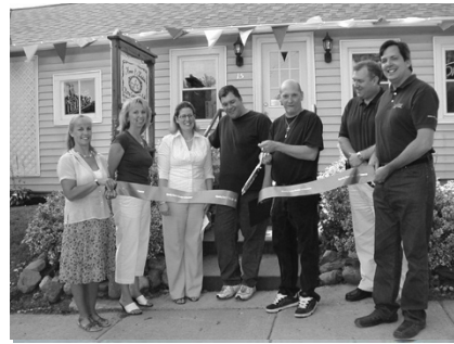
Arnie & Eddie's Restaurant 16 East Perry Ave., Silver Springs 493-3009