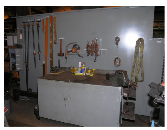
Welding area after