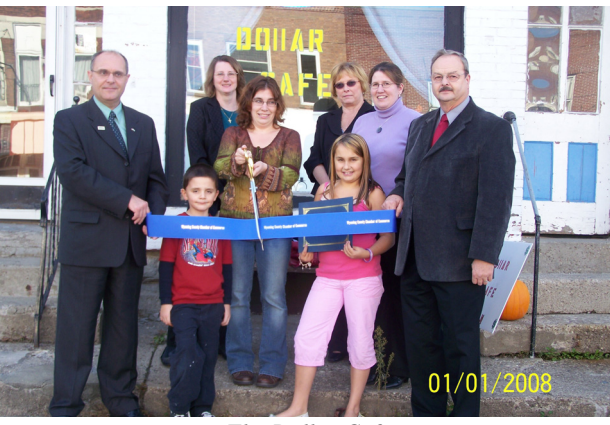
The Dollar Cafe 23 Market St., Attica 708-4141

name, speaks to their prices. Their goa is to serve people the best coffee, great beverages and breakfast foods for $1.