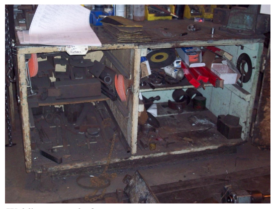
Welding area before

The initial Lean Training Seminar was organized by the Chamber's Industry Committee. If there are issues or concerns facing your manufacting company, please contact the office so we can take your concern to the committee.